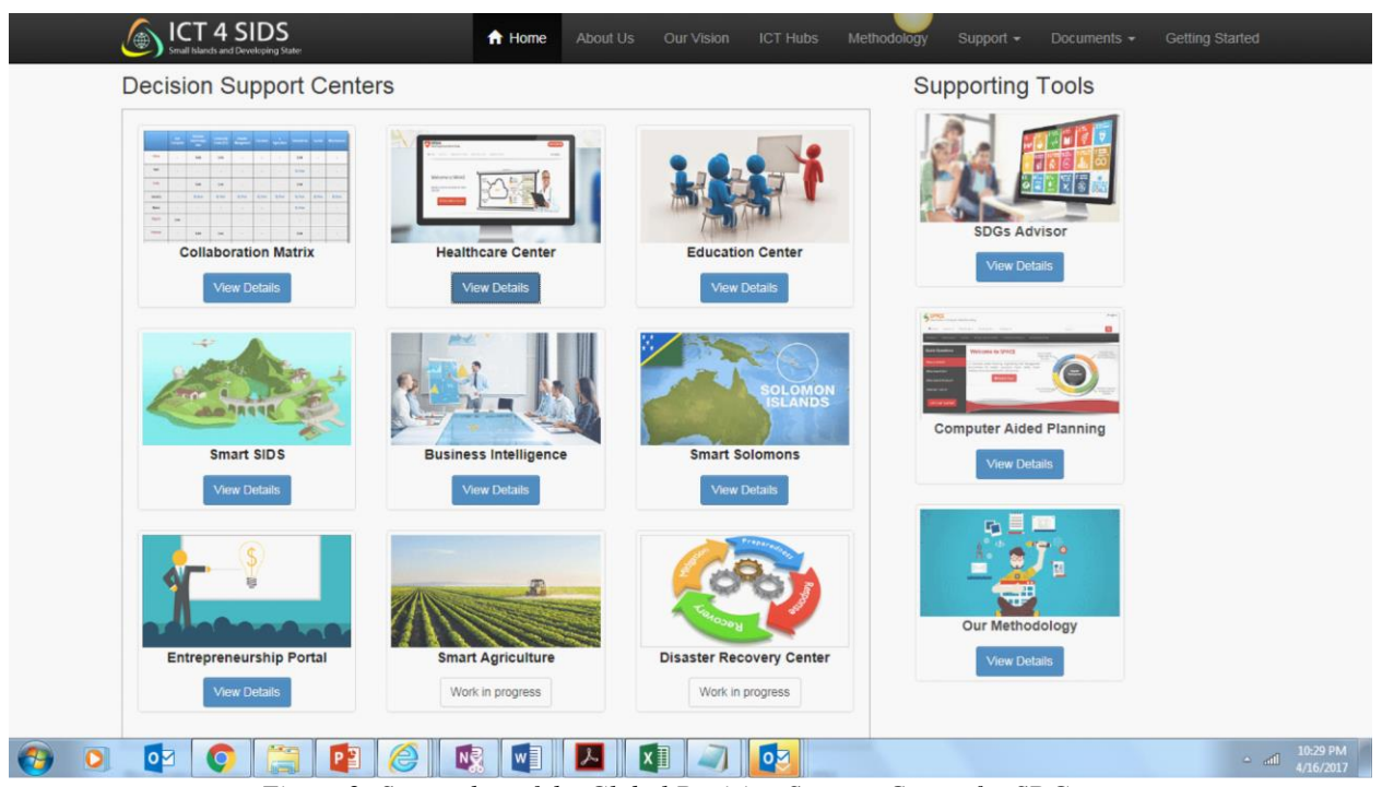
Figure 2: Screenshot of the Global Decision Support Center for SDGs